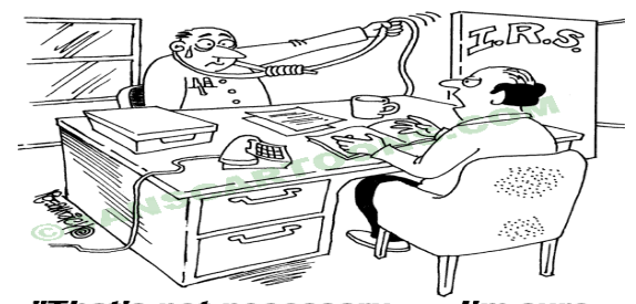
"That's not necessary . . . I'm sure we can work something out."

IMPORTANT: If at anytime you are feeling lost and are struggling with the material, come see me or e-mail me with your questions or concerns or sign up for a tutor in the accounting lab, they are free!!!!. I also encourage you to study with other accounting students, exchange e-mail addresses and phone numbers. This way if you miss a class, you can call or e-mail someone regarding notes, instructions, assignment changes, etc. I want you all to do well in this class, but you need to take the initiative if you are having some difficulty with the material. Don't wait till after an exam to tell me you're having problems; let's work on it before the exam to ensure a successful exam experience.